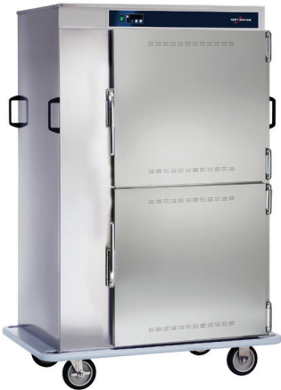
1000-BQ2/96 Shown with split door option