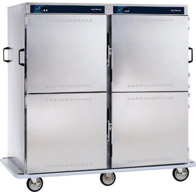
1000-BQ2/192 Shown with split door option